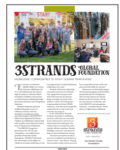
Sample profiles from our 22 nd annual Capital Region Cares 2017-2018